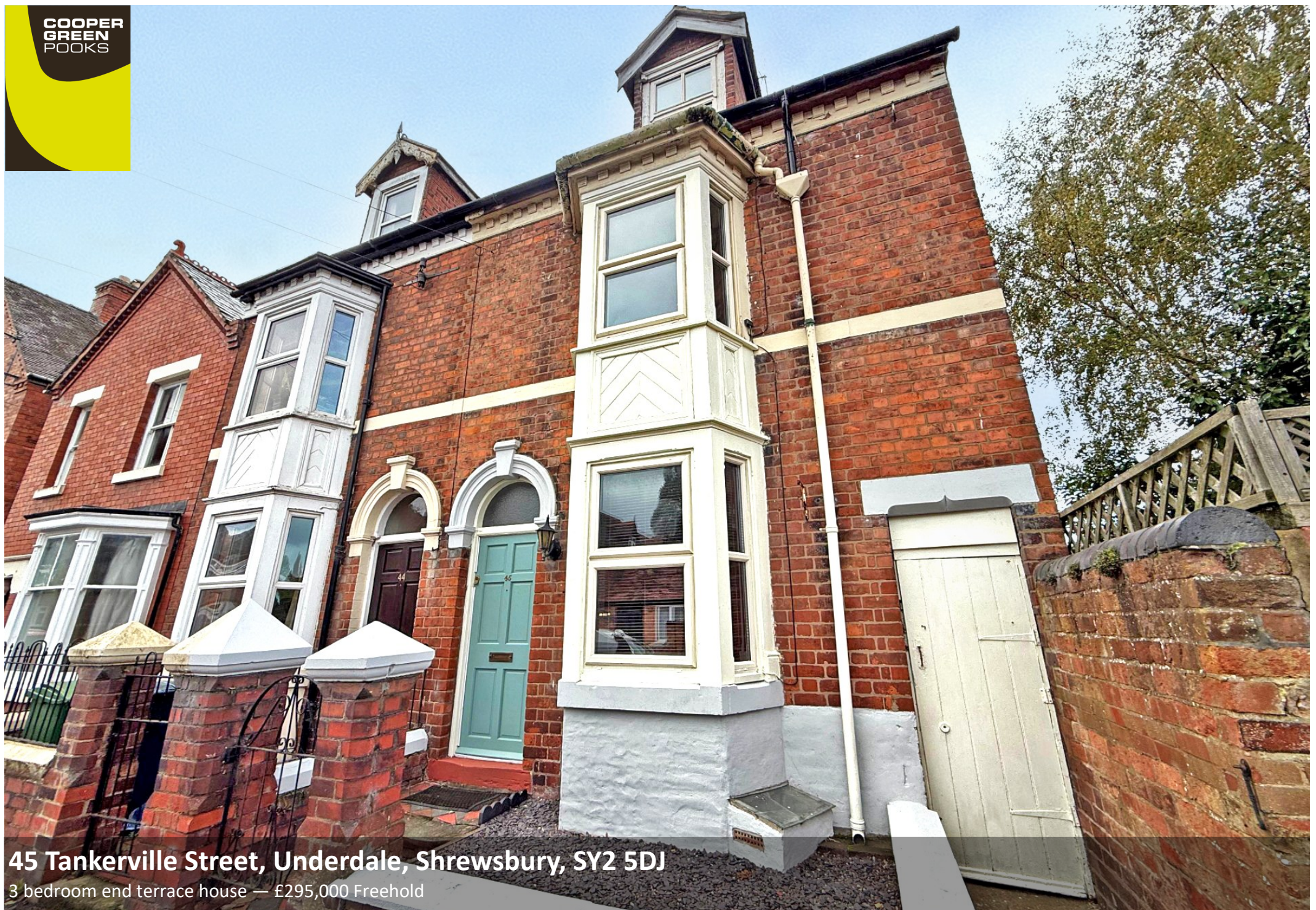
45 Tankerville Street, Underdale, Shrewsbury, SY2 5DJ

3 bedroom end terrace house — £295,000 Freehold